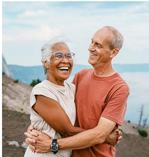
Tips for Healthy Aging