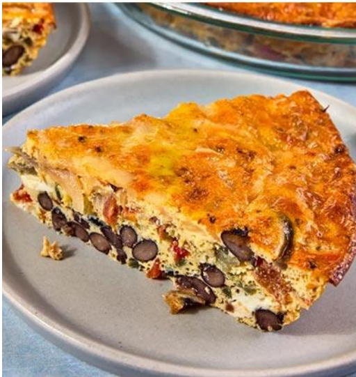
Black Bean & Pepper Jack Quiche